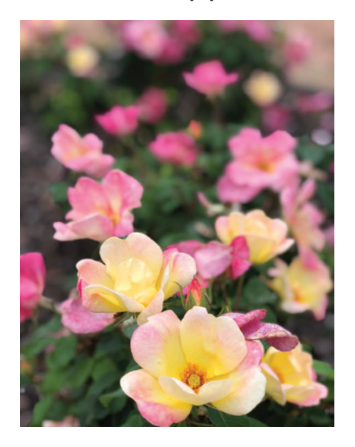
The Champion™ Sunblush Rose ('MEItitka') Greenleaf Nursery Company: This colorful, healthy shrub rose bears loads of single yellow blooms that transition to pink as they age. The mixture of newly opened yellow and older pink blooms is dramatic.