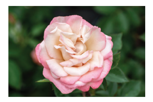
♠ Pinkerbelle™ ('MEIvanae') - Star® Roses and Plants: Flushes of fragrant, double multitoned pink to soft lavender flowers with subtle darker stipples are produced throughout the season on this healthy hybrid tea.