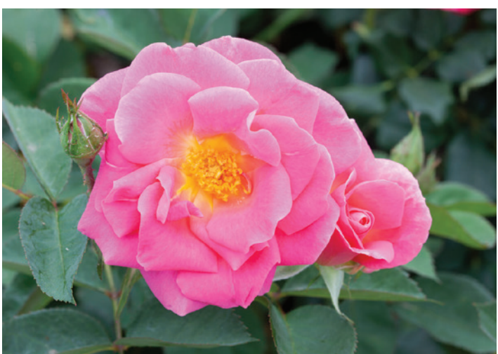
↑ Pink Freedom™ ('WEKpumpahor') - Weeks Roses: Fragrant, double-pink blooms open flat to reveal yellow stamens. Bloom clusters are elevated and displayed nicely above this healthy, vigorous shrub rose.