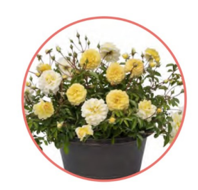
Scentifall Lemon ('VPRO 14-02') Compact and slightly spreading, this fragrant double yellow rose is wellsuited for hanging baskets, patio pots and low borders.