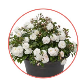
Scentifall Blush ('VPRO 14-08') Very compact and dense, this sweetlyscented double blush rose is floriferous and is well-suited for hanging baskets, patio pots and low borders.