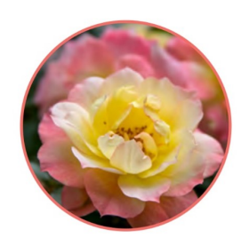
Oso Easy Italian Ice ('CHEWnicebell')

The large quantities of single-pink blooms against glossy foliage makes this exceptionally floriferous and dense shrub rose a beautiful addition to pollinator-friendly gardens and borders.