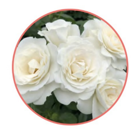
White Veranda ('KORfloci111') Compact and bushy, this floriferous floribunda boasts double clear-white blooms. It is great for patio pots and borders.