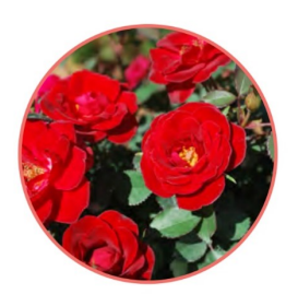
Sunrosa Red ('ZARsbjoh') Rich-red, loosely double blooms are generously produced over this dense and symmetrical miniature shrub rose.