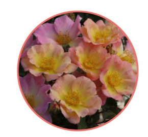
Watercolors Home Run ('WEKsolcibarko') Large clusters of ruffled single blooms on this shrub rose open bright pink with yellow petal bases and gently transition to shades